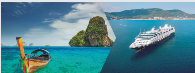
Port Blair to Port Blair